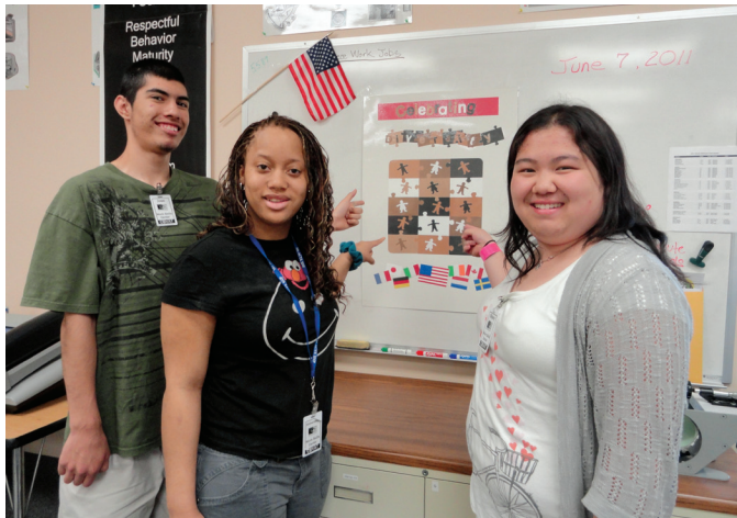
Students display confidence in the products they create, such as this poster made with cutouts using the Cutout Maker.